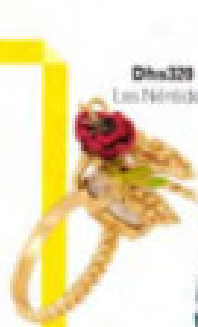
Dhs329 Los Néctares