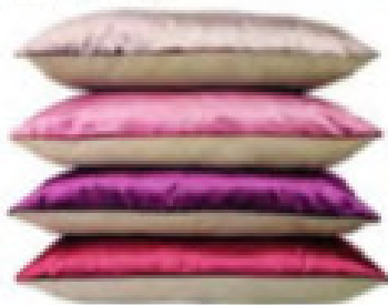
Dhs399 Ikkh Bedspread at Bloomingdale's Home