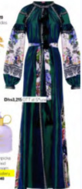
Dhs3,219 OOT at Styloop