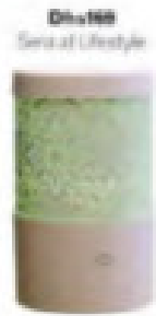
Dhs160 Sera at Lifestyle