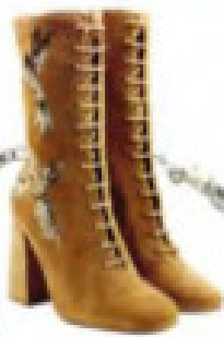
Dhs2,204 Foot Valentino at Styloop