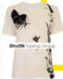
Dhs299 Topshop Linquel