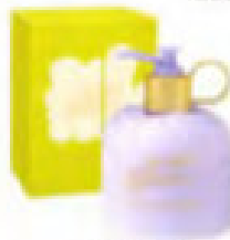
Loite Lampoon Perfumed Velvet Cream at Paris Chloé Dhs480