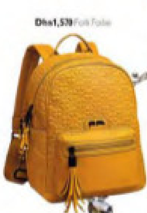
Dhs1,539 Fort Forté