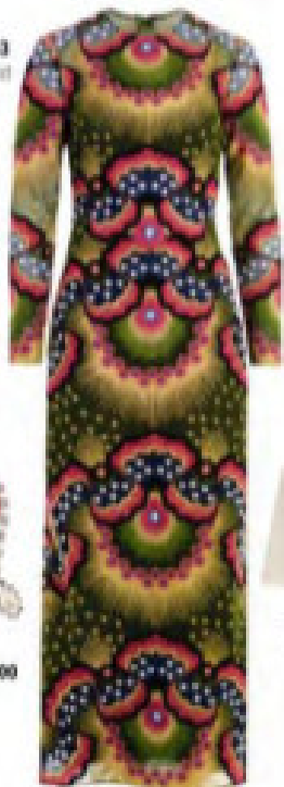
Dhs34,343 Valentino at Styloop