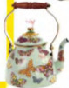
Dhs460 Mackenzie Childs at Bloomingdale's Home